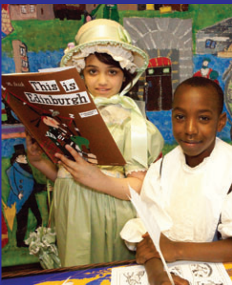
Museum of Edinburgh (Huntly House - Royal Mile)